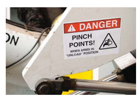
Safety and Facility ID