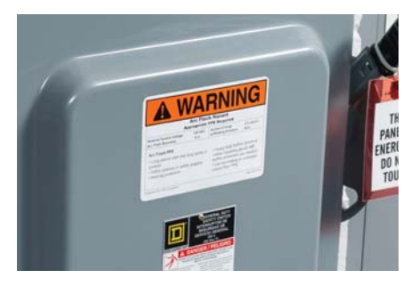
Arc Flash Labels

Visit BradylD.com/B30-B33Labels to find materials or download the Label and Ribbon Guide.